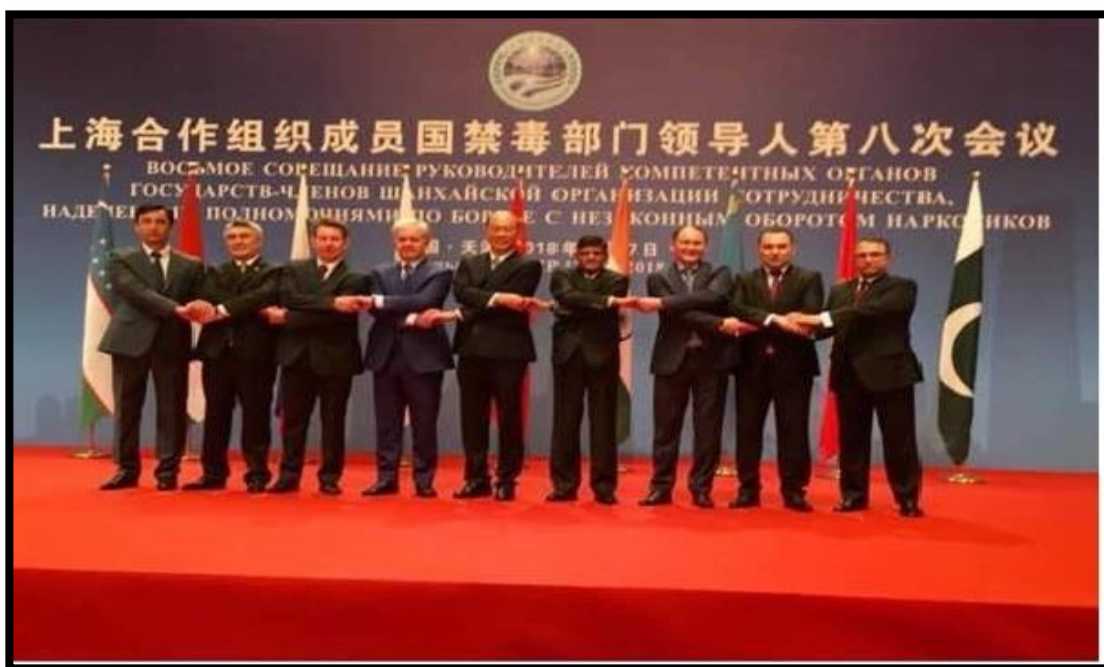
Meeting of Heads of Narcotic Control Agencies of SCO members at China