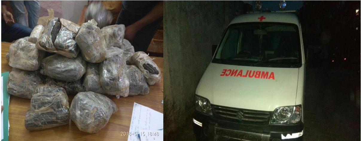
Seizure of 24.500 Kg of Hashish by NCB, Lucknow Zonal Unit