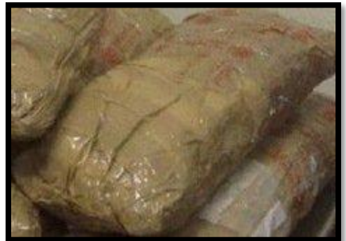
Seizure of 14.000 Kg of Hashish by NCB, Patna Zonal Unit