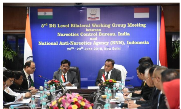
Director General Level Bilateral Working Group meeting between Narcotics Control Bureau (NCB) India and National Narcotics Board (BNN), Indonesia