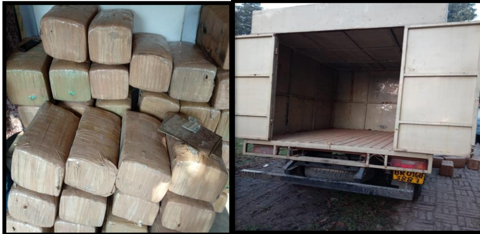
Seizure of 517 Kg of Ganja by NCB, Patna Zonal Unit