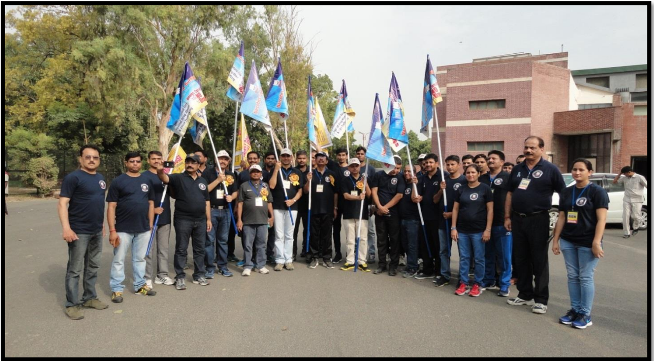
Team NCB at National Stadium, New Delhi