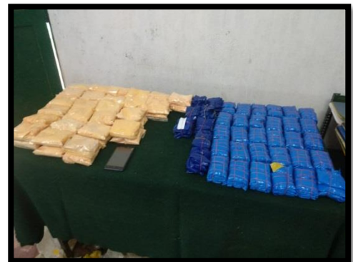
Seizure of 6000 tablets of WY by NCB, Guwahati Zonal Unit