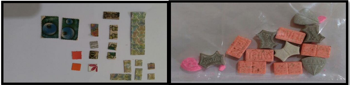
The photograph depicting the seized substances in the brick form