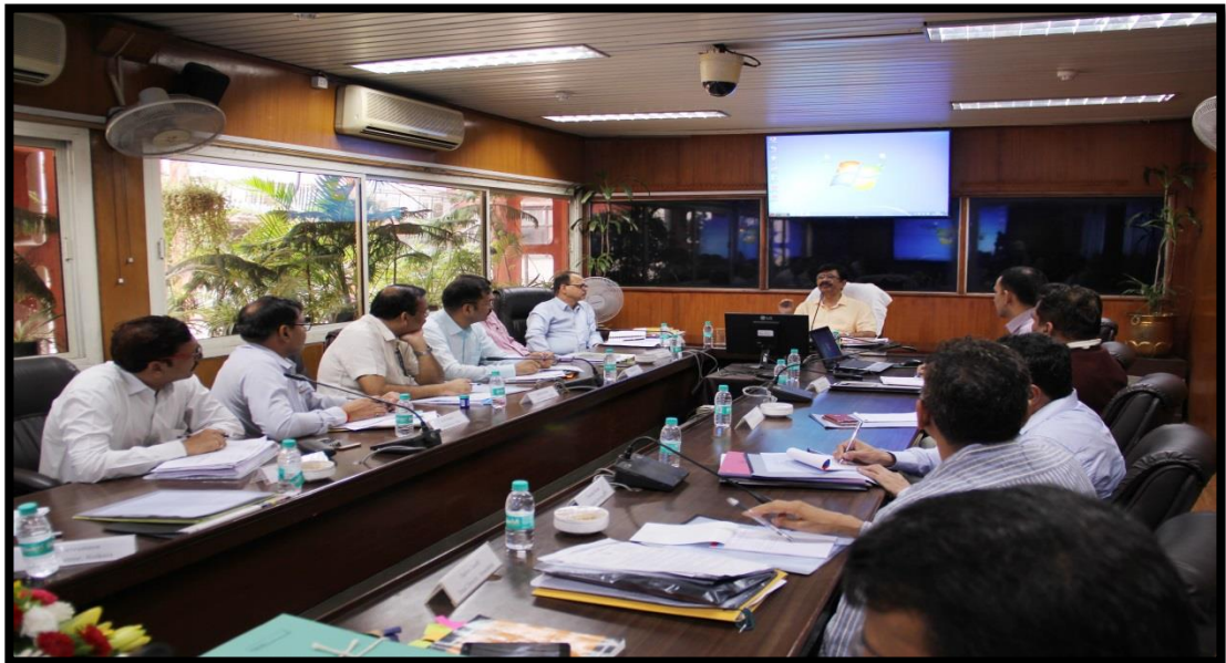
Zonal Director's Conference held at NCB Headquarters, New Delhi