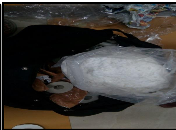
Seizure of 05 Kg of Ephedrine by NCB, Delhi Zonal Unit