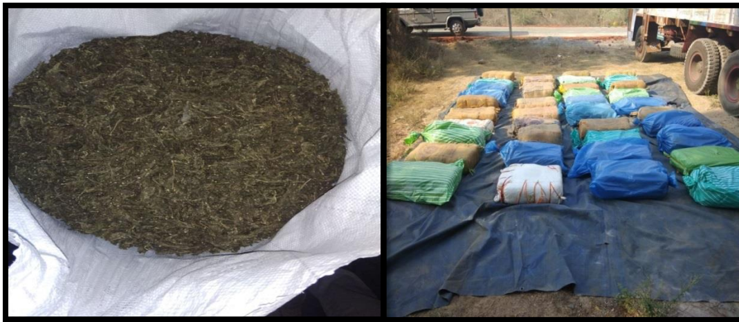
Seizure of 957.700 Kg of Ganja by NCB, Bangalore Zonal Unit.