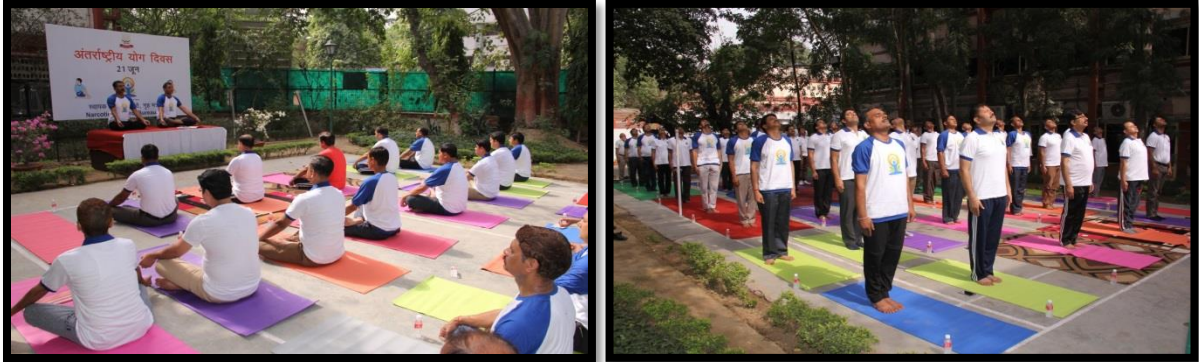
Observance of International Yoga Day at NCB Headquarters, New Delhi