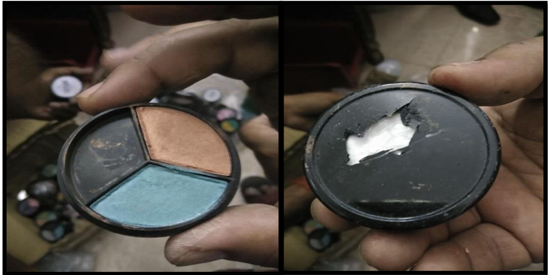
Seizure of 360 gm of Cocaine by NCB, Mumbai Zonal Unit. The photograph depicting the concealment of drugs.