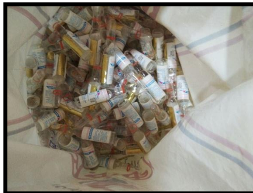
Seizure of 1429 injections of Buprenorphine by NCB, Kolkata Zonal Unit