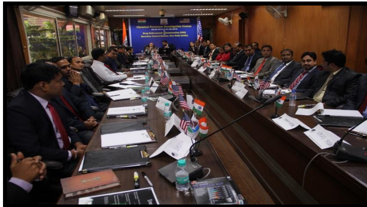
Five days training program on "Chemical Precursor Investigation" at NCB Headquarters New Delhi by the DEA, USA.