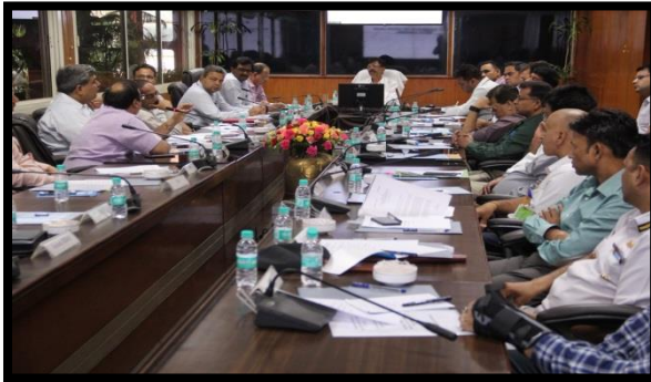
4 th Quarterly meeting of Narco Coordination Centre (NCORD) in New Delhi