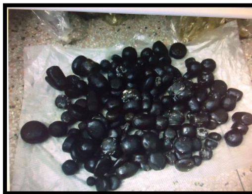
Seizure of 15.000 Kg of Hashish by NCB, Jammu Zonal Unit