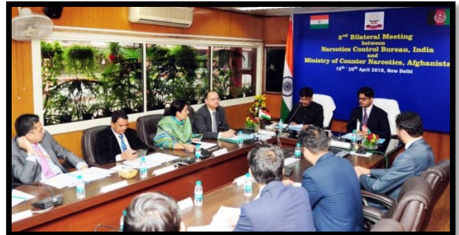
2 nd Bilateral meeting between Narcotics Control Bureau (NCB), India and Ministry of Counter Narcotics (MCN), Afghanistan