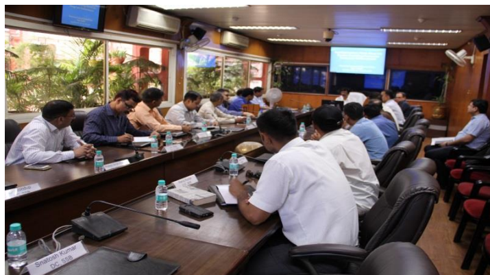
Two days' familiarization workshop for Officers of Border Guarding Forces/ State Police on "Drug Law Enforcement" from 04-05 June, 2018 at NCB HQ, New Delhi