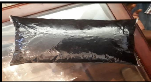
Seizure of 16.53 Kg of Hashish Oil by NCB Cochin Sub Zone & Kerala Police