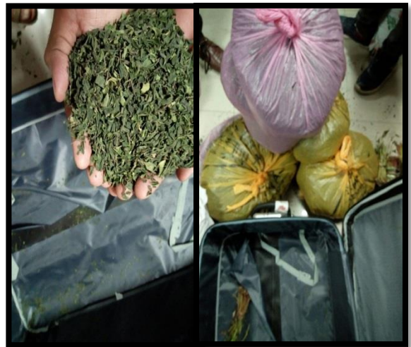
Seizure of 60 Kg of Khat Leaves (Chatt Edulis/Mira Leaves) by NCB, Mumbai Zonal Unit