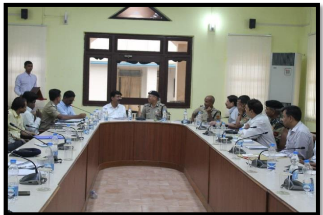
Coordination meeting between DG, NCB and DGP Tripura