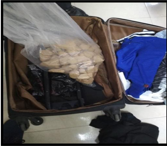
The photograph depicting the concealment of drugs