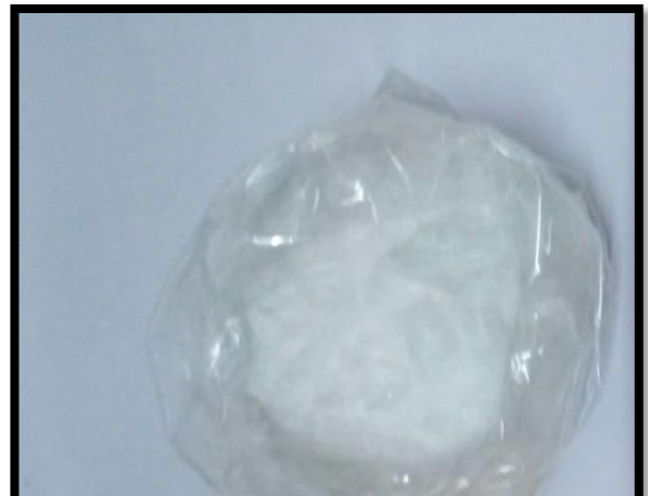
Seizure of 535 gm of Methamphetamine by NCB, Chennai Zonal Unit