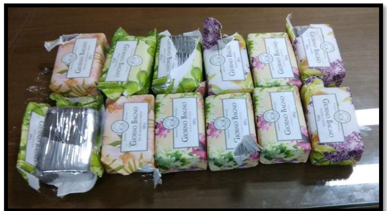
Seizure of 2.008 Kg of Cocaine by NCB, Cochin Sub Zone