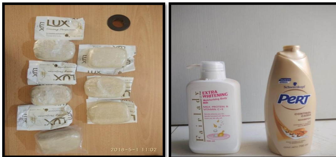
The photograph depicting the concealment of the drug.