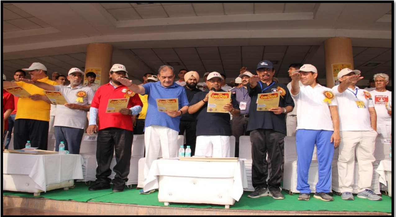
Mass pledge to fight against drug menace at National Stadium in presence of Hon'ble Minister, MoSJ&E, Hon'ble Minister, Ministry of Steel, Hon'ble MoS, MoSJ&E and DG, NCB.