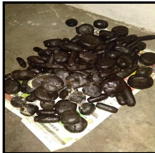
Seizure of 10.043 Kg of Charas on 25.05.2018 at Ahmedabad, Gujarat