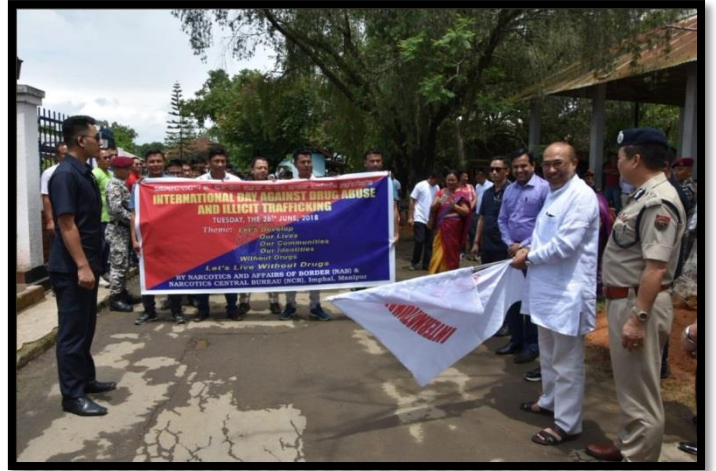
Anti Drug Rally flag off by Hon'ble CM of Manipur at Imphal