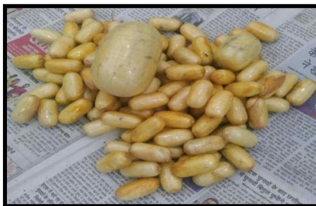
106 Capsules containing 930 gm of Cocaine, swallowed by one Brazilian national