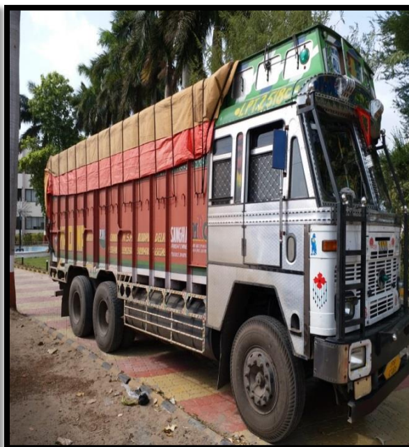
Seizure of 591.39 Kg of Ganja by NCB, Ahmedabad Zonal Unit