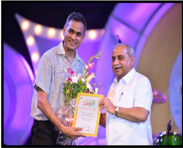
Felicitation of Hon'ble Deputy CM of Gujarat