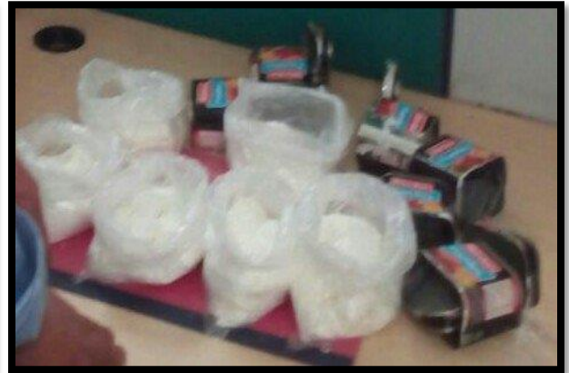
Seizure of 1.8 kg of Cocaine at Cochin International Airport, Cochin, Keral by NCB, Chennai Zonal Unit