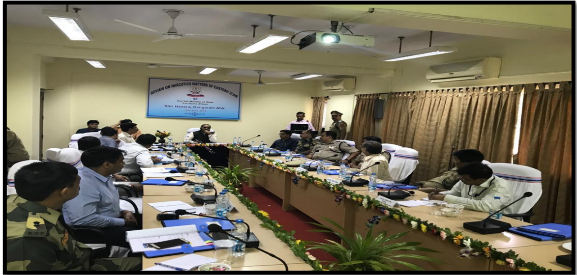
Review meeting of Eastern Zone of NCB by Shri Hansraj Gangaram Ahir, Hon'ble Minister of State (Home)