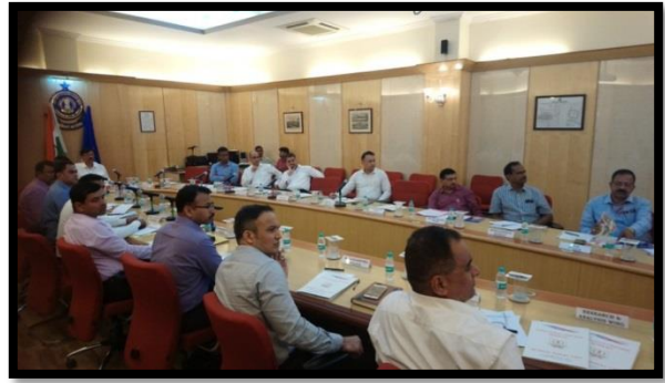
7 th Monthly Narco Coordination Centre (NCORD) Meeting held in Mumbai