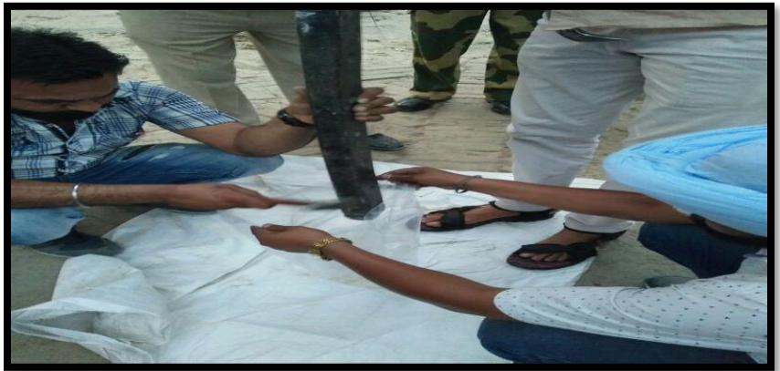
Seizure of 1.145 Kg of Heroin

in agricultural land. Two persons were arrested. The suspected source of the seized drug was South West Asia.