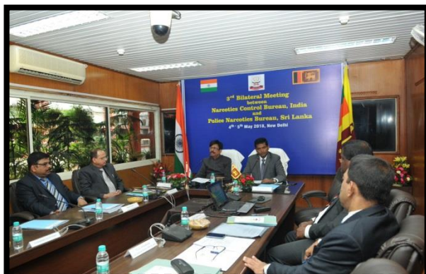
3 rd Bilateral meeting between Narcotics Control Bureau (NCB), India and Police Narcotics Bureau (PNB), Sri Lanka