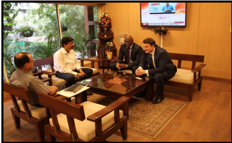
Bilateral meeting between NCB, India and INTERPOL