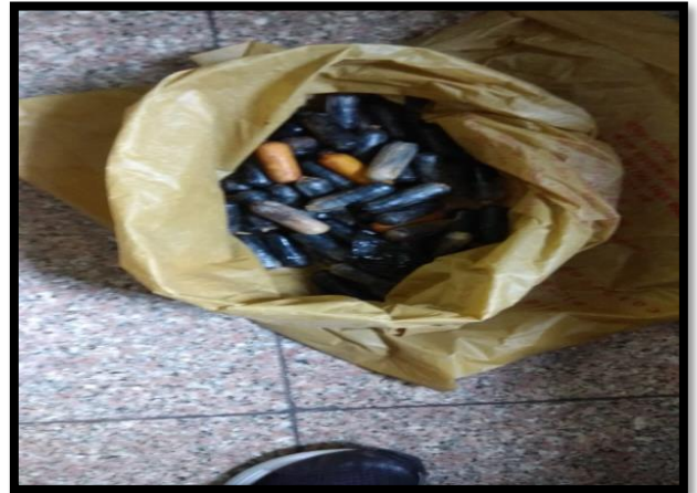
Seizure of 900 gram of Cocaine by NCB, Delhi Zonal Unit