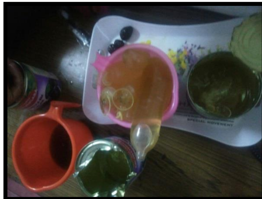
Seizure of 2.650 Kg of liquid Cocaine by NCB, Delhi Zonal Unit